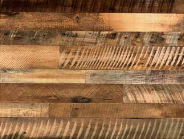
SKIP-PLANED BROWN BARNWOOD