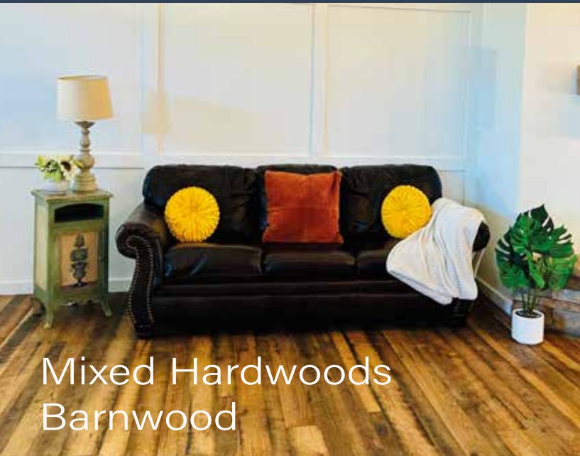
Mixed Hardwoods Barnwood