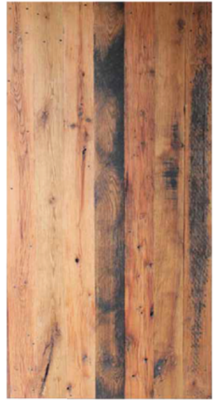
SIMPLE FACED BARN DOOR