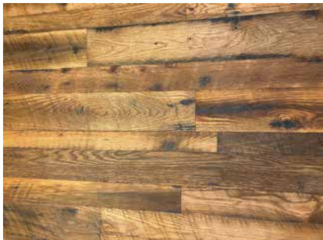
SKIP-PLANED MIXED HARDWOODS BARNWOOD