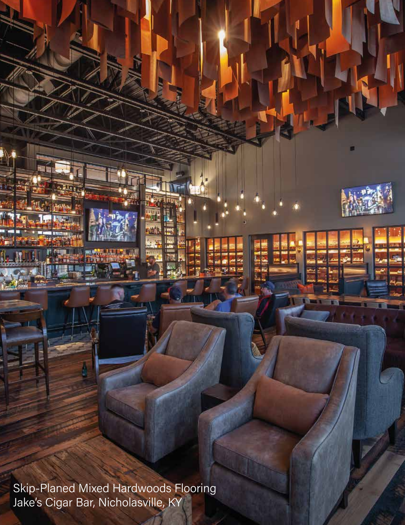
Skip-Planned Mixed Hardwoods Flooring Jake's Cigar Bar, Nicholasville, KY