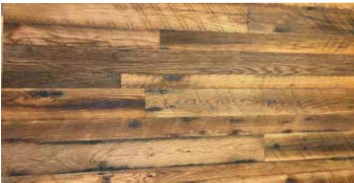
SKIP-PLANED MIXED HARDWOODS