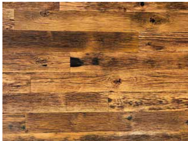
SKIP-PLANED WIREBRUSHED RACEHORSE OAK