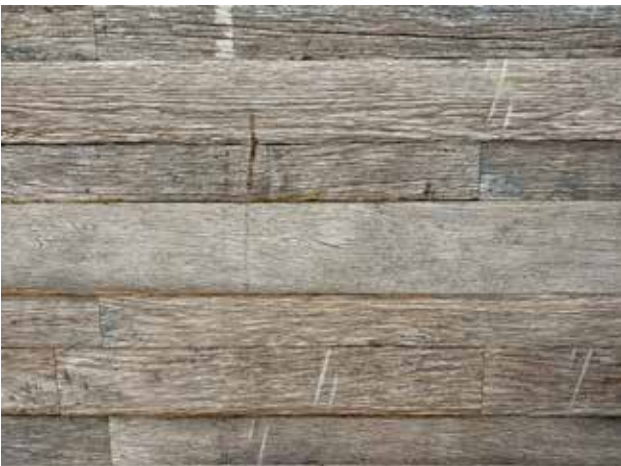
WHITEWASHED RACEHORSE OAK