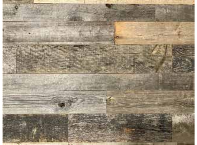
WEATHERED GRAY BARNWOOD