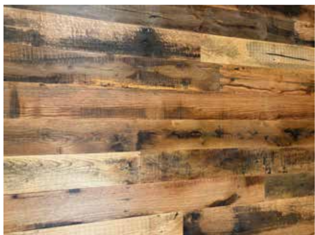
SKIP-PLANED INDUSTRIAL OAK