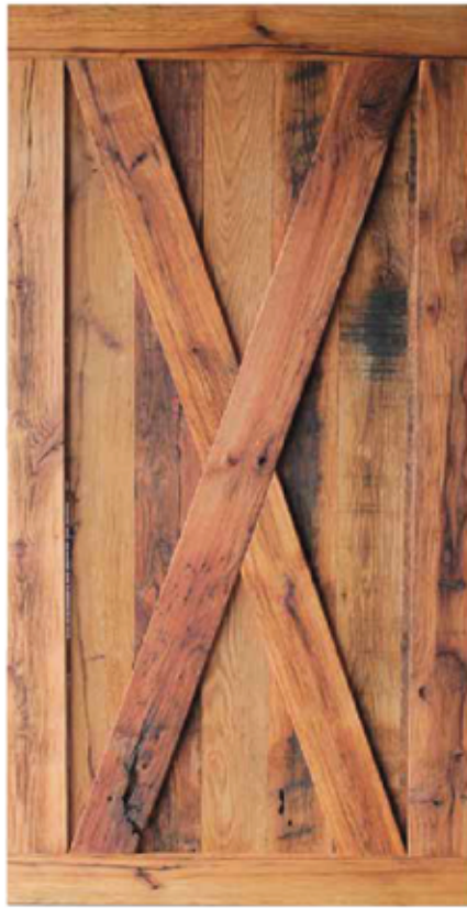
BROWN X-PATTERN BARN DOOR