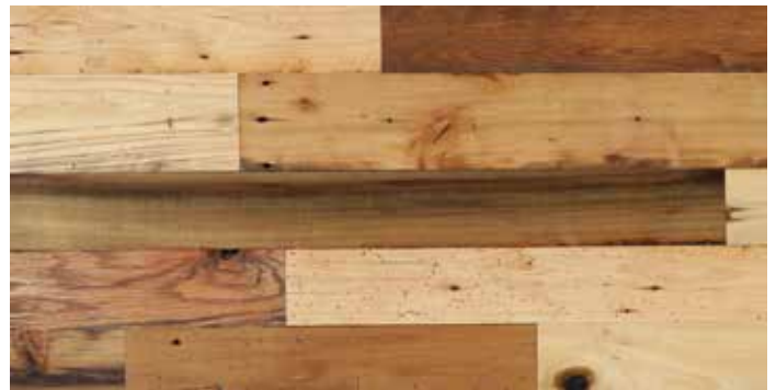
CLEAN FACE MIXED HARDWOODS