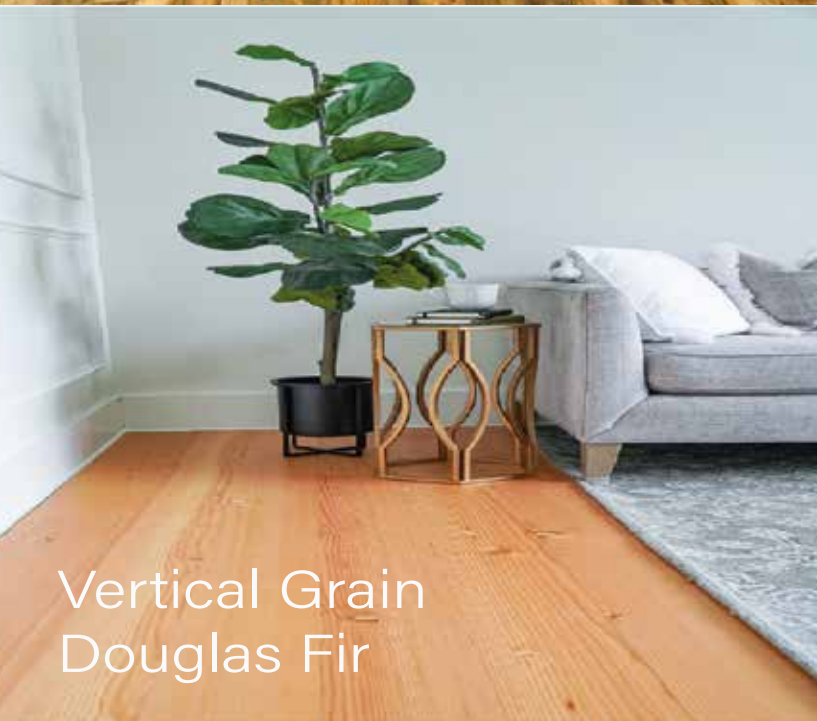
Vertical Grain Douglas Fir