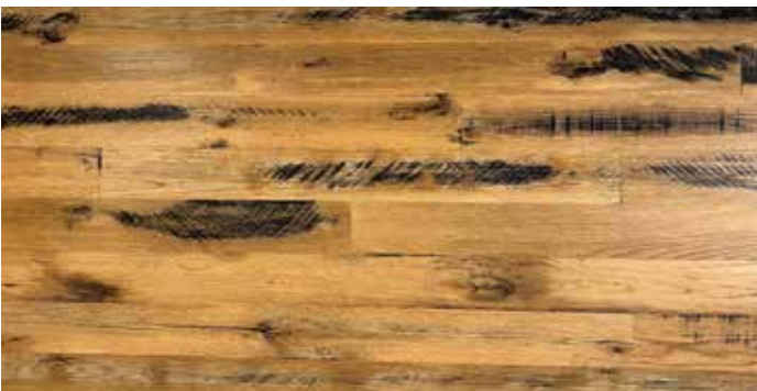
OAK SKIP-PLANED BLACK