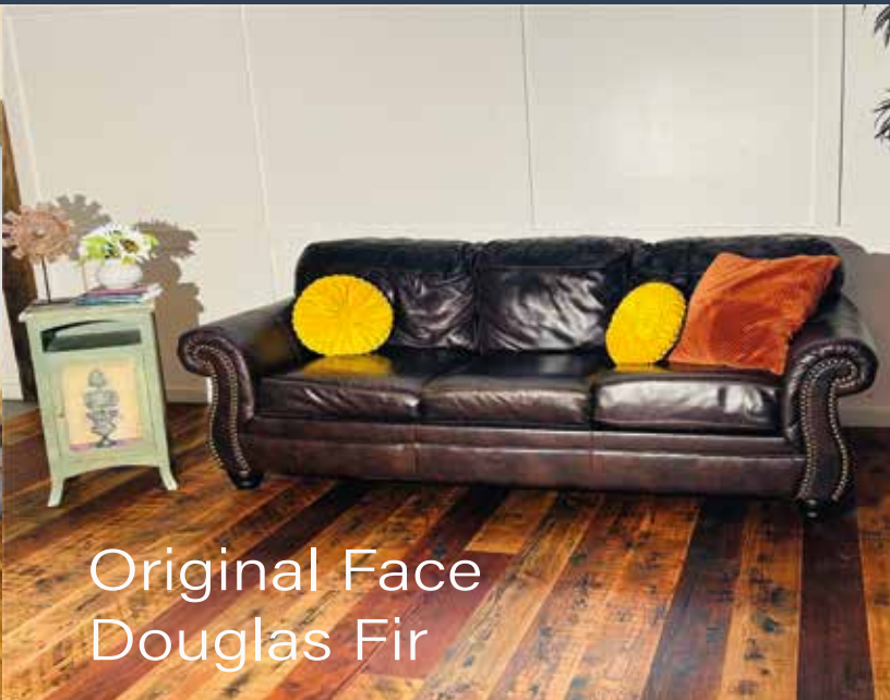
Original Face Douglas Fir