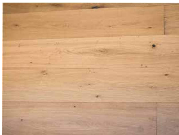
EUROPEAN WHITE OAK