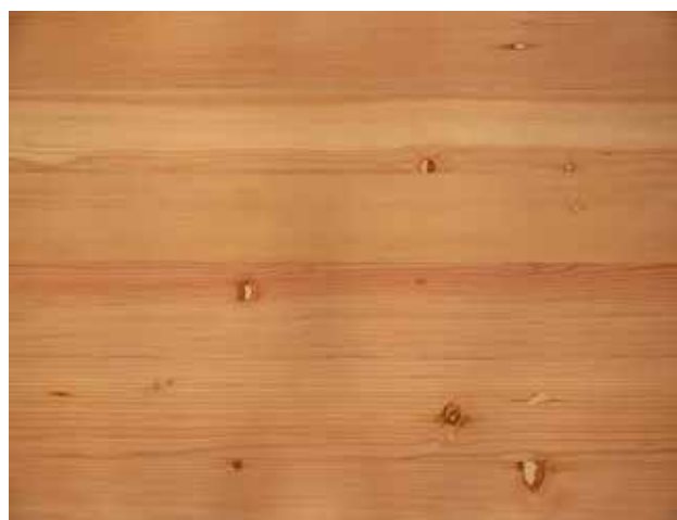
CLEAN FACE DOUGLAS FIR