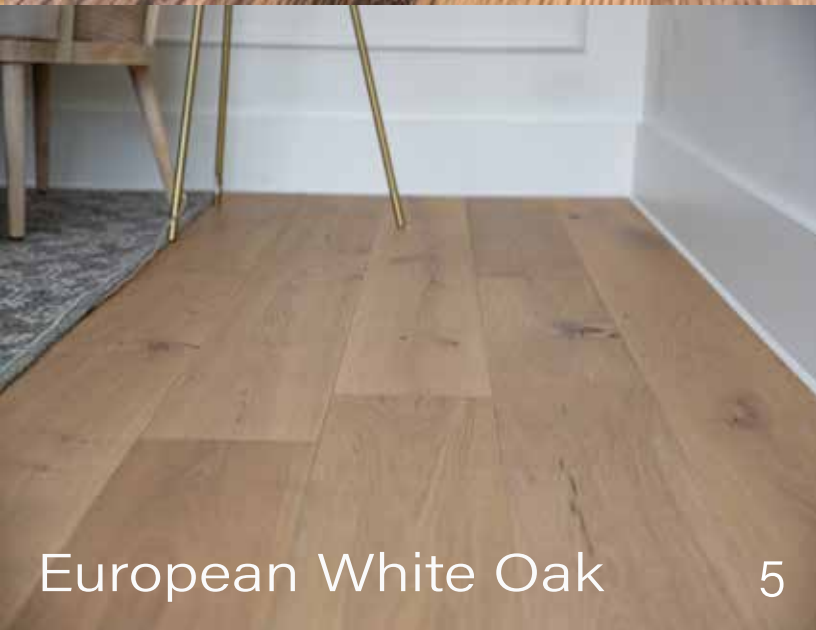
European White Oak