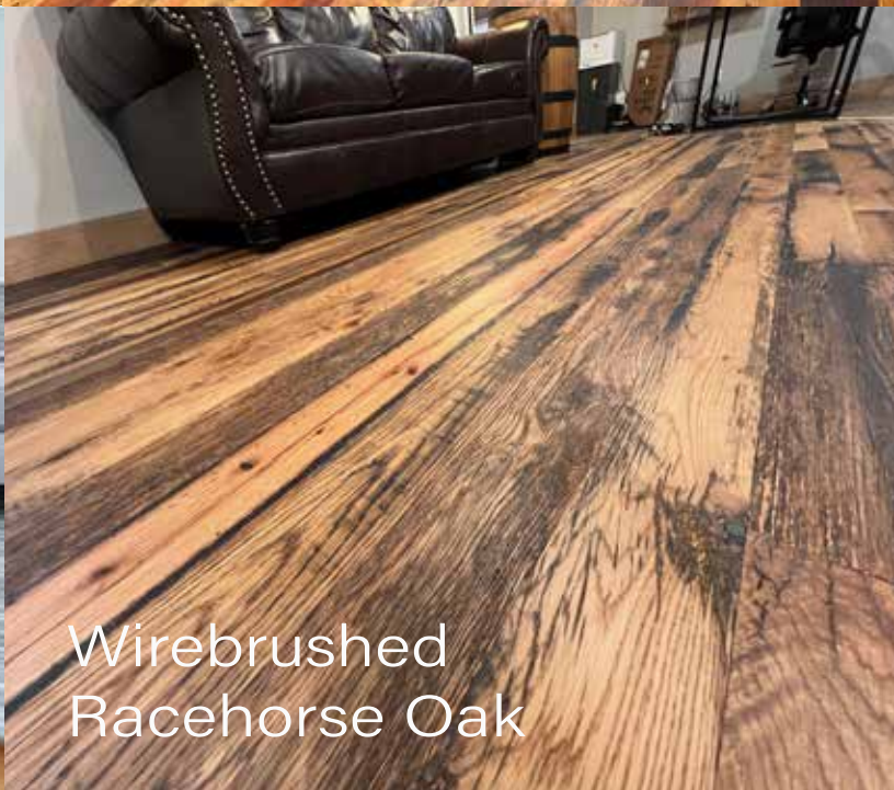
Wirebrushed Racehorse Oak