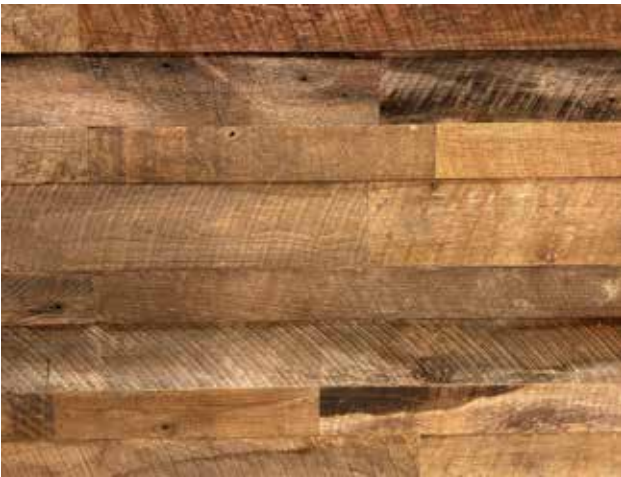
ORIGINAL DIRTY-TOP BARNWOOD