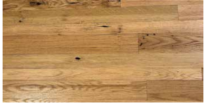
CLEAN FACE OAK