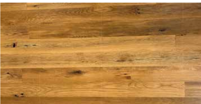
OAK CLEAN FACE