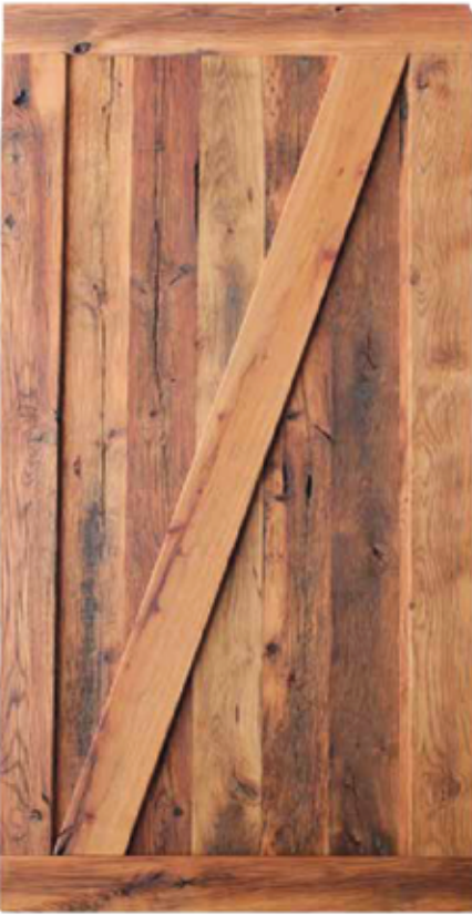
BROWN Z-PATTERN BARN DOOR