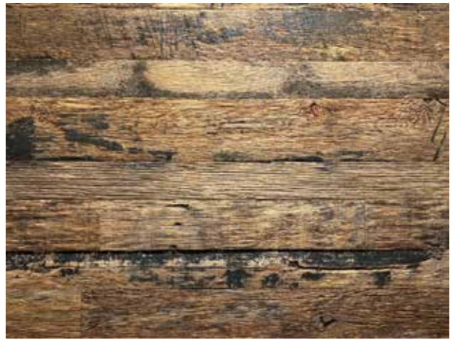
WIREBRUSHED RACEHORSE OAK