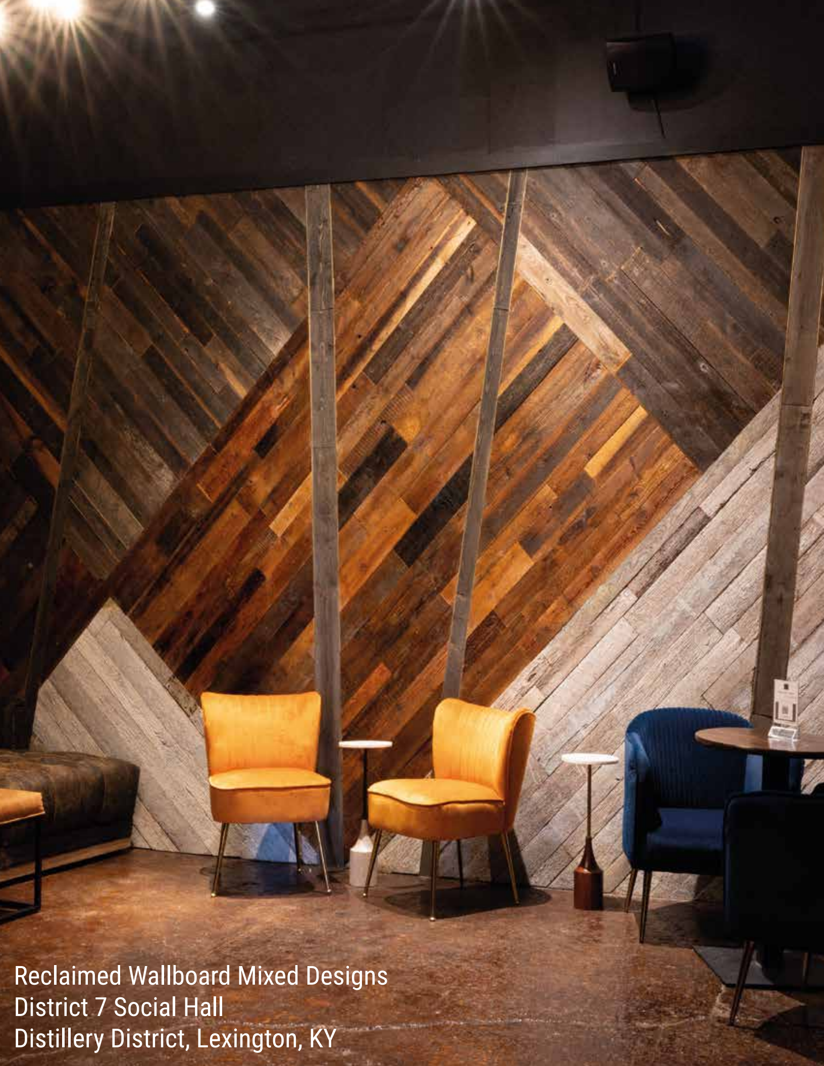
Reclaimed Wallboard Mixed Designs District 7 Social Hall Distillery District, Lexington, KY