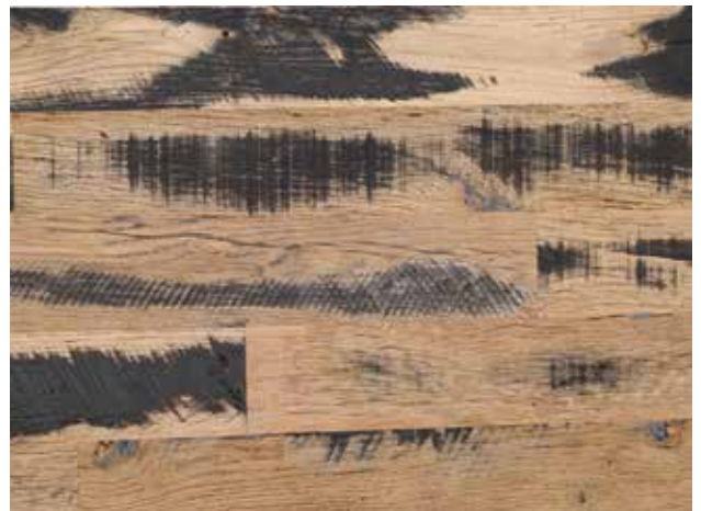
SKIP-PLANED BLACK RACEHORSE OAK